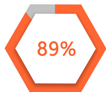
Reduction in amount of Cookies