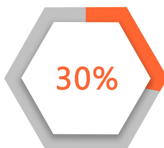
Reduced Logon Times